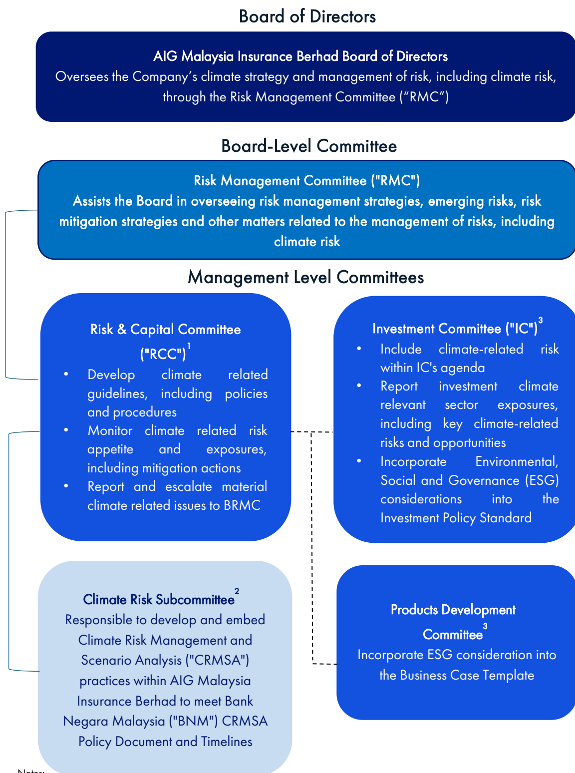
Figure 1: AIG Malaysia Insurance Berhad's Climate-Related Governance Structure